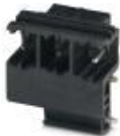
PCB headers, number of positions: 3, pin layout: Linear pinning

Feed-through header - GMSTBO 2,5 HV/3-GR-7,25 THRR44 - 2200262