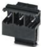
PCB headers, number of positions: 3, pin layout: Linear pinning

Feed-through header - GMSTBO 2,5 HV/3-GL-7,25 THRR44 - 2200263