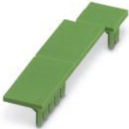
Terminal cover, 1 strip covers up to 12 terminal points, for ME-BUS terminal opening, (male side)

Please be informed that the data shown in this PDF Document is generated from our Online Catalog. Please find the complete data in the user's documentation. Our General Terms of Use for Downloads are valid ( http://phoenixcontact.com/download )