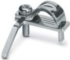
Shield connection clamp for printed circuit terminal block

Please be informed that the data shown in this PDF Document is generated from our Online Catalog. Please find the complete data in the user's documentation. Our General Terms of Use for Downloads are valid ( http://phoenixcontact.com/download )