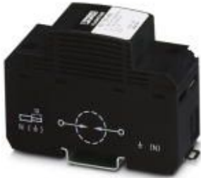
Type 1 / Class I / B arrester (lightning current arrester) with encapsulated N-PE total spark gap, 1-channel. Housing width: 35 mm (2 Div.)

Please be informed that the data shown in this PDF Document is generated from our Online Catalog. Please find the complete data in the user's documentation. Our General Terms of Use for Downloads are valid ( http://phoenixcontact.com/download )