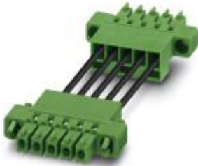
Spare local bus cable, for INTERBUS-ST modules

Please be informed that the data shown in this PDF Document is generated from our Online Catalog. Please find the complete data in the user's documentation. Our General Terms of Use for Downloads are valid ( http://phoenixcontact.com/download )