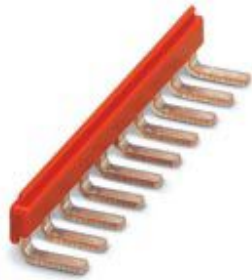
Insertion bridges, divisible, isolated comb spine, color red, 84-pos.

Please be informed that the data shown in this PDF Document is generated from our Online Catalog. Please find the complete data in the user's documentation. Our General Terms of Use for Downloads are valid ( http://phoenixcontact.com/download )