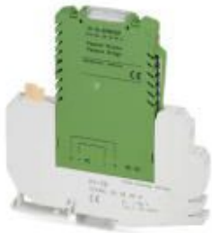
Bridging module, for bridging input and output circuit

Please be informed that the data shown in this PDF Document is generated from our Online Catalog. Please find the complete data in the user's documentation. Our General Terms of Use for Downloads are valid ( http://phoenixcontact.com/download )