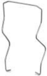
Relay retaining bracket, wiring to suit relay base RIF-3 and PR3, for 52 mm high octal relay

Please be informed that the data shown in this PDF Document is generated from our Online Catalog. Please find the complete data in the user's documentation. Our General Terms of Use for Downloads are valid ( http://phoenixcontact.com/download )