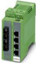
Ethernet Lean Managed Switch with four 10/100 Mbps RJ45 ports and two 10/100 Mbps FX-SC multi-mode ports

Please be informed that the data shown in this PDF Document is generated from our Online Catalog. Please find the complete data in the user's documentation. Our General Terms of Use for Downloads are valid ( http://phoenixcontact.com/download )