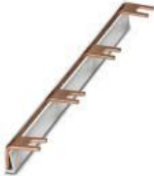
Wiring bridge for modules with connecting pitch 17.5 mm, 1-phase, 10 pitches with contact sequence 1-0-0

Please be informed that the data shown in this PDF Document is generated from our Online Catalog. Please find the complete data in the user's documentation. Our General Terms of Use for Downloads are valid ( http://phoenixcontact.com/download )