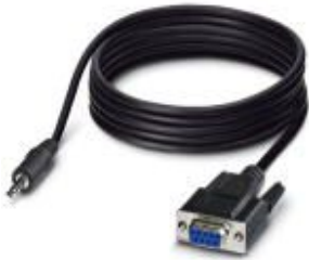
Interface cable for Inline temperature controllers (IB IL TEMPCON ...), single

Please be informed that the data shown in this PDF Document is generated from our Online Catalog. Please find the complete data in the user's documentation. Our General Terms of Use for Downloads are valid ( http://phoenixcontact.com/download )