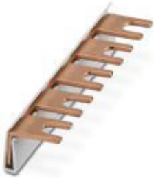
Wiring bridge for modules with connecting pitch 17.5 mm, 1-phase, 5-pos.

Please be informed that the data shown in this PDF Document is generated from our Online Catalog. Please find the complete data in the user's documentation. Our General Terms of Use for Downloads are valid ( http://phoenixcontact.com/download )