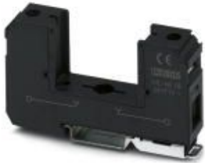
Base element for type 2 arresters of the VALVETRAB MS series of products. Design: 1-channel

Please be informed that the data shown in this PDF Document is generated from our Online Catalog. Please find the complete data in the user's documentation. Our General Terms of Use for Downloads are valid ( http://phoenixcontact.com/download )