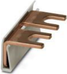
Wiring bridge for modules with connecting pitch 17.5 mm, 1-phase, 2-pos.

Please be informed that the data shown in this PDF Document is generated from our Online Catalog. Please find the complete data in the user's documentation. Our General Terms of Use for Downloads are valid ( http://phoenixcontact.com/download )