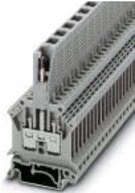
Component connector, pitch: 6 mm, number of positions: 1, color: gray

Please be informed that the data shown in this PDF Document is generated from our Online Catalog. Please find the complete data in the user's documentation. Our General Terms of Use for Downloads are valid ( http://phoenixcontact.com/download )