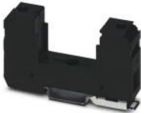
Base element for type 1/2 arresters from the VALVETRAB MS T1/T2 product range. Version: 1-channel

Please be informed that the data shown in this PDF Document is generated from our Online Catalog. Please find the complete data in the user's documentation. Our General Terms of Use for Downloads are valid ( http://phoenixcontact.com/download )