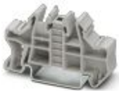
Quick mounting end clamp for NS 35/7,5 DIN rail or NS 35/15 DIN rail, with marking option, width: 9.5 mm, color: gray