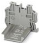
Quick mounting end clamp for NS 35/7,5 DIN rail or NS 35/15 DIN rail, with marking option, with parking option for FBS...5, FBS...6, KSS 5, KSS 6, width: 5.15 mm, color: gray