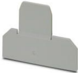
Partition plate, length: 75 mm, width: 2.5 mm, height: 67 mm, color: gray

Please be informed that the data shown in this PDF Document is generated from our Online Catalog. Please find the complete data in the user's documentation. Our General Terms of Use for Downloads are valid ( http://phoenixcontact.com/download )