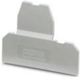
End cover, length: 67.2 mm, width: 2.5 mm, height: 52 mm, color: gray

Please be informed that the data shown in this PDF Document is generated from our Online Catalog. Please find the complete data in the user's documentation. Our General Terms of Use for Downloads are valid ( http://phoenixcontact.com/download )