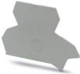
End cover, length: 72 mm, width: 1.5 mm, height: 59 mm, color: gray

Please be informed that the data shown in this PDF Document is generated from our Online Catalog. Please find the complete data in the user's documentation. Our General Terms of Use for Downloads are valid ( http://phoenixcontact.com/download )