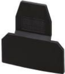
End cover, length: 56 mm, width: 2.5 mm, height: 66.5 mm, color: black

Please be informed that the data shown in this PDF Document is generated from our Online Catalog. Please find the complete data in the user's documentation. Our General Terms of Use for Downloads are valid ( http://phoenixcontact.com/download )