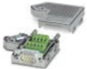
D-SUB connector, 9-pos., male connector, one cable entry < 35°, universal type for all systems, pin assignment: 1, 2, 3, 4, 5, 6, 7, 8, 9 to screw connection terminal block

D-SUB bus connector - SUBCON 9/M-SH - 2761509