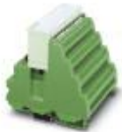
Replacement clamping part for IB ST 24 DI 32/2

Replacement clamping part - IB STTB 24 DI 32/2 - 2753012