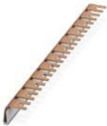
Wiring bridge for modules with connecting pitch 17.5 mm, 1-phase, 12-pos.

Please be informed that the data shown in this PDF Document is generated from our Online Catalog. Please find the complete data in the user's documentation. Our General Terms of Use for Downloads are valid ( http://phoenixcontact.com/download )