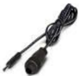
Cinch connecting cable, for addressing FLX ASI M12 devices

Cable for programming - ASI CC ADR CAB CINCH - 2741341