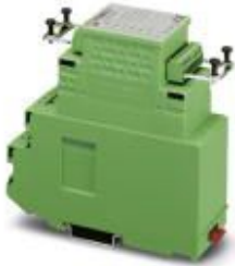
Replacement shield connection clamp for INTERBUS-ST bus terminal BKM-...

Please be informed that the data shown in this PDF Document is generated from our Online Catalog. Please find the complete data in the user's documentation. Our General Terms of Use for Downloads are valid ( http://phoenixcontact.com/download )