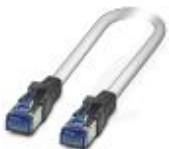
Patch cable, CAT6, pre-assembled, 2.0 m

Patch cable - FL CAT6 PATCH 2,0 - 2891589