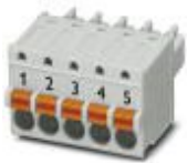
PCB connector, nominal current: 8 A, rated voltage (III/2): 160 V, nominal cross section: 1.5 mm 2 , number of positions: 5, pitch: 3.81 mm, connection method: Push-in spring connection, color: light gray, contact surface: Tin

Printed-circuit board connector - FK-MCP 1,5/ 5-ST-3,81GY35BD1-5 - 1015782