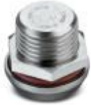
Plug, M20, for FB... enclosure