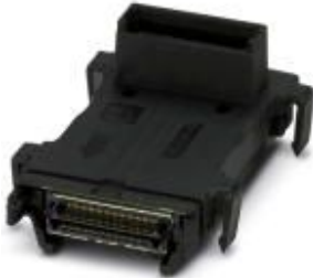
Axioline P bus base module for housing type BK

Please be informed that the data shown in this PDF Document is generated from our Online Catalog. Please find the complete data in the user's documentation. Our General Terms of Use for Downloads are valid ( http://phoenixcontact.com/download )