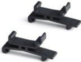
Adapter for mounting on DIN rails.

Please be informed that the data shown in this PDF Document is generated from our Online Catalog. Please find the complete data in the user's documentation. Our General Terms of Use for Downloads are valid ( http://phoenixcontact.com/download )