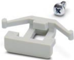
Press-drawn section housings, Snap-on foot for DIN rail, incl. screw

Please be informed that the data shown in this PDF Document is generated from our Online Catalog. Please find the complete data in the user's documentation. Our General Terms of Use for Downloads are valid ( http://phoenixcontact.com/download )