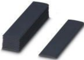
Decorative strip for HC-ALU panel mounting base

Please be informed that the data shown in this PDF Document is generated from our Online Catalog. Please find the complete data in the user's documentation. Our General Terms of Use for Downloads are valid ( http://phoenixcontact.com/download )