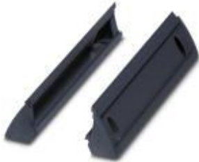
Mounting foot for panel mounting the HC-ALU panel mounting base

Please be informed that the data shown in this PDF Document is generated from our Online Catalog. Please find the complete data in the user's documentation. Our General Terms of Use for Downloads are valid ( http://phoenixcontact.com/download )