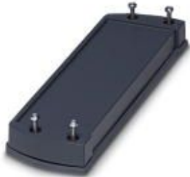
Profile housing, Side part, width: 190.4 mm, height: 58 mm

Please be informed that the data shown in this PDF Document is generated from our Online Catalog. Please find the complete data in the user's documentation. Our General Terms of Use for Downloads are valid ( http://phoenixcontact.com/download )