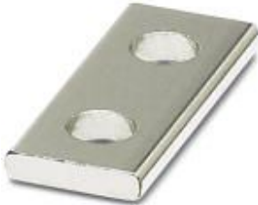
Connection rail, number of positions: 2, color: silver

Please be informed that the data shown in this PDF Document is generated from our Online Catalog. Please find the complete data in the user's documentation. Our General Terms of Use for Downloads are valid ( http://phoenixcontact.com/download )