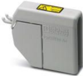
Covering hood, length: 137.4 mm, width: 49.8 mm, height: 77 mm, color: gray

Please be informed that the data shown in this PDF Document is generated from our Online Catalog. Please find the complete data in the user's documentation. Our General Terms of Use for Downloads are valid ( http://phoenixcontact.com/download )