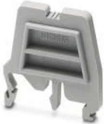
Flange cover, length: 43.3 mm, width: 5.2 mm, color: gray

Please be informed that the data shown in this PDF Document is generated from our Online Catalog. Please find the complete data in the user's documentation. Our General Terms of Use for Downloads are valid ( http://phoenixcontact.com/download )