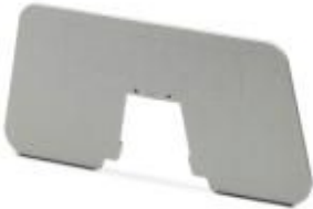
The figure shows the product version UHV-TP 1

Separating plate, length: 180.2 mm, width: 2 mm, height: 68.3 mm, color: gray