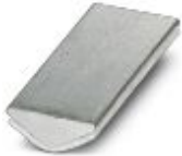
Insertion profile, color: silver