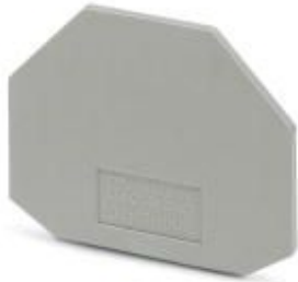
End cover, length: 54 mm, width: 2.3 mm, height: 41.5 mm, color: gray

Please be informed that the data shown in this PDF Document is generated from our Online Catalog. Please find the complete data in the user's documentation. Our General Terms of Use for Downloads are valid ( http://phoenixcontact.com/download )