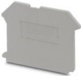
End cover, length: 50 mm, width: 2 mm, height: 36 mm, color: gray

Please be informed that the data shown in this PDF Document is generated from our Online Catalog. Please find the complete data in the user's documentation. Our General Terms of Use for Downloads are valid ( http://phoenixcontact.com/download )