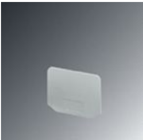
End cover, width: 2.3 mm, color: gray

Please be informed that the data shown in this PDF Document is generated from our Online Catalog. Please find the complete data in the user's documentation. Our General Terms of Use for Downloads are valid ( http://phoenixcontact.com/download )