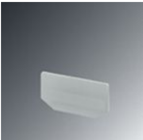
End cover, length: 68 mm, width: 2.2 mm, height: 34 mm, color: gray

Please be informed that the data shown in this PDF Document is generated from our Online Catalog. Please find the complete data in the user's documentation. Our General Terms of Use for Downloads are valid ( http://phoenixcontact.com/download )