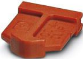
Locking clip for engagement catches

Please be informed that the data shown in this PDF Document is generated from our Online Catalog. Please find the complete data in the user's documentation. Our General Terms of Use for Downloads are valid ( http://phoenixcontact.com/download )