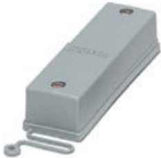
Protective cover, Protective covers, type: VC4, housing material: PA 6, color: gray

Please be informed that the data shown in this PDF Document is generated from our Online Catalog. Please find the complete data in the user's documentation. Our General Terms of Use for Downloads are valid ( http://phoenixcontact.com/download )