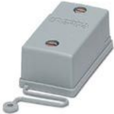
Protective cover, Protective covers, type: VC1, housing material: PA 6, color: gray

Please be informed that the data shown in this PDF Document is generated from our Online Catalog. Please find the complete data in the user's documentation. Our General Terms of Use for Downloads are valid ( http://phoenixcontact.com/download )