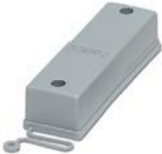
Protective cover, Protective covers, type: VC4, housing material: PA 6, color: gray

Please be informed that the data shown in this PDF Document is generated from our Online Catalog. Please find the complete data in the user's documentation. Our General Terms of Use for Downloads are valid ( http://phoenixcontact.com/download )