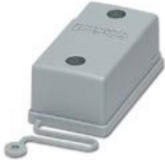
Protective cover, Protective covers, type: VC1, housing material: PA 6, color: gray

Please be informed that the data shown in this PDF Document is generated from our Online Catalog. Please find the complete data in the user's documentation. Our General Terms of Use for Downloads are valid ( http://phoenixcontact.com/download )