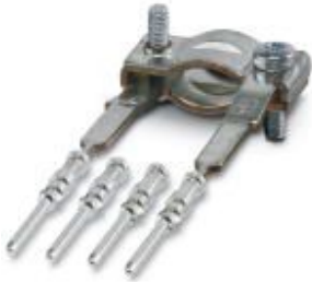
Shield connection for one shielded cable on male contact carriers, without loose crimp contacts

Please be informed that the data shown in this PDF Document is generated from our Online Catalog. Please find the complete data in the user's documentation. Our General Terms of Use for Downloads are valid ( http://phoenixcontact.com/download )